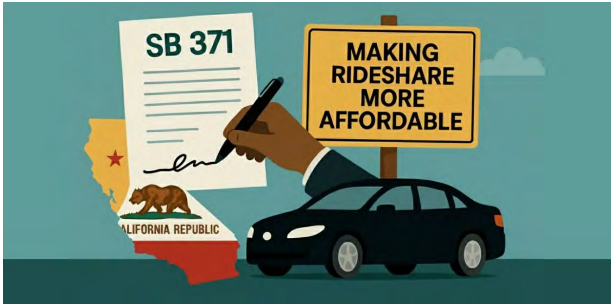
Uber-generated image promising lower rates from SB 371. Days after the legislation was signed into law, Uber filed a ballot measure to take away more rights from accident victims.

Uber's corporate strategy is clear: limit liability, over-reserve, and re-invest the savings in robocars. Meanwhile innocent accident victims are being asked to give up their rights to recover for their injuries in all auto accidents so Uber and its executives can profit from its cynical strategy.