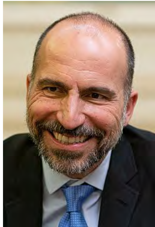
Uber CEO Dara Khosrowshahi.

However, Uber’s California ballot measure has prompted a countermeasure requiring strict background checks for Uber drivers and Uber’s strict liability for sexual assaults that occur in Ubers. Both ballot measures appear likely to qualify for the November 2026 ballot. In addition, Uber’s epidemic of sexual assaults has been the subject of multiple New York Times investigative articles, highlighting the counter measure for the public and shareholders. Not surprisingly, Uber’s stock price has fallen by more than 25% since the filing of its ballot measure in October. Meanwhile, Uber’s CEO Dara Khosrowshahi was compensated nearly $36 million in 2025.