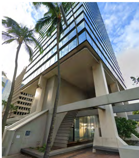
Aleka Insurance's corporate headquarters in Honolulu, Hawaii.