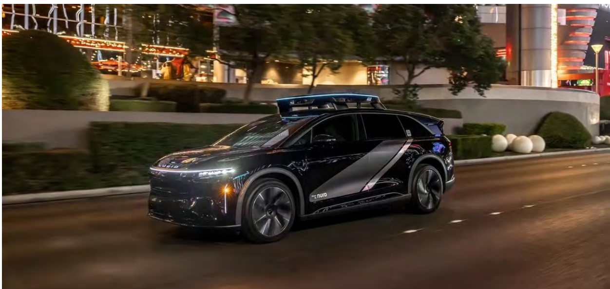
An Uber Lucid robotaxi.

Overall, Uber has partnered with over 20 car companies and self-driving companies and wants to offer rides in 15 cities by the end of 2026, including San Francisco and Los Angeles. By the end of the decade, it wants to be the main facilitator of rides.