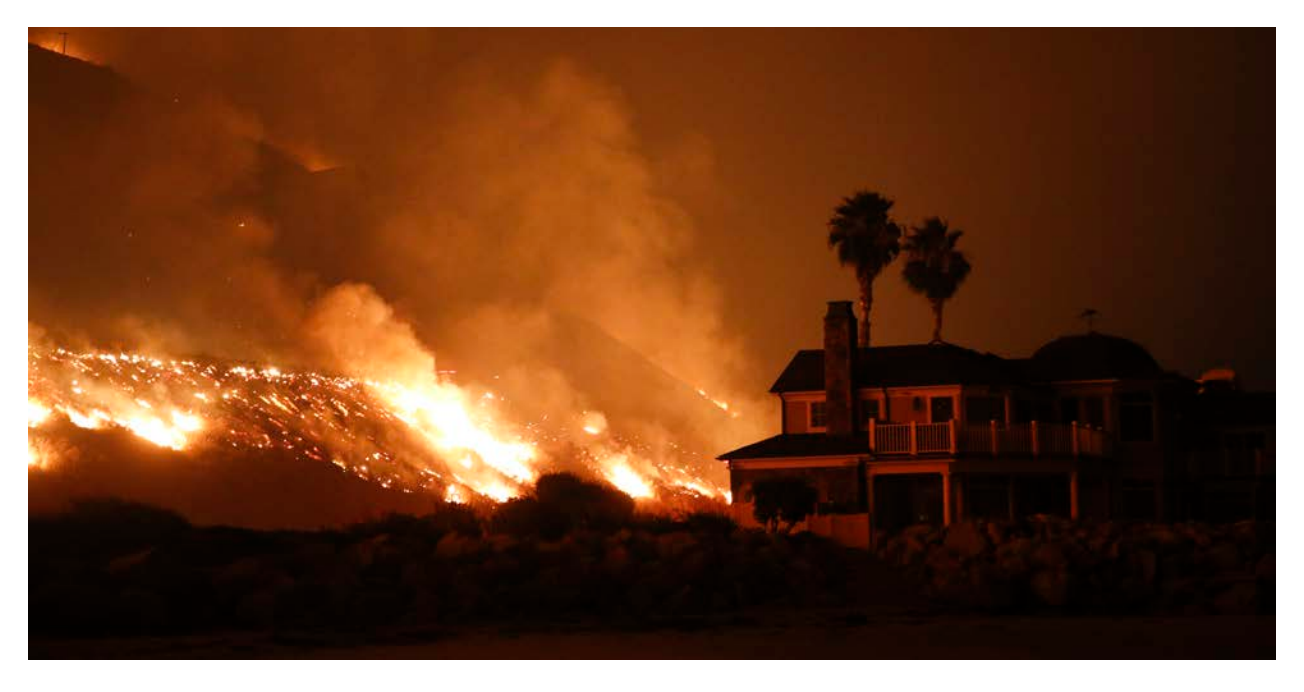
A wildfire threatens homes as it burns along the 101 Freeway Tuesday, Dec. 5, 2017, in Ventura, Calif. Raked by ferocious Santa Ana winds, explosive wildfires northwest of Los Angeles and in the city's foothills burned a psychiatric hospital and scores of homes and other structures Tuesday and forced the evacuation of tens of thousands of people.

While not reproduced in this report, other companies that have added smoke damage language to their policies include: CSE Insurance Group (endorsement added 2018); Falls Lake (James River Insurance) (endorsement added 2018); Farmers Insurance (endorsement added 2015); Travelers Insurance (2022 homeowners policy booklet); and MAPFRE Insurance (endorsement added 2015).