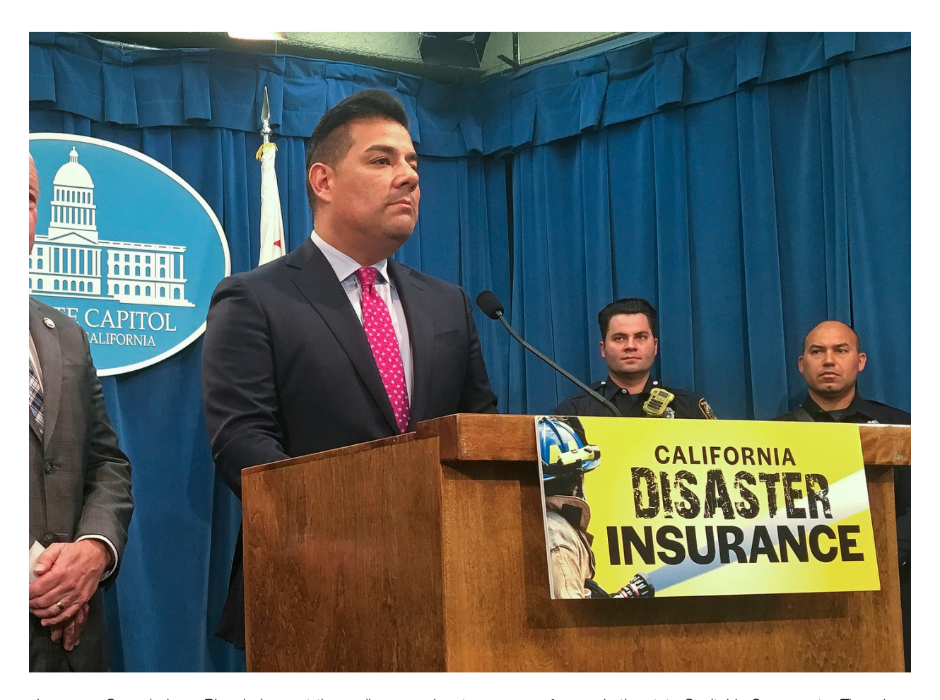
Insurance Commissioner Ricardo Lara, at the podium, speaks at a news conference in the state Capitol in Sacramento, Thursday, Feb. 14, 2019. California has experienced 11 of the top 20 most destructive fires in its history since 2007.

Farmers' 2016 "Smart Plan Home Policy California" is another example. The policy contains a provision that purports to preclude litigation if Farmers pays out "any part of [an appraisal] award." This policy language appears to be in direct conflict with Code of Civil Procedure sections 1285 and 1286.2, which expressly provide policyholders with a right to bring legal action asking a court to vacate an appraisal.